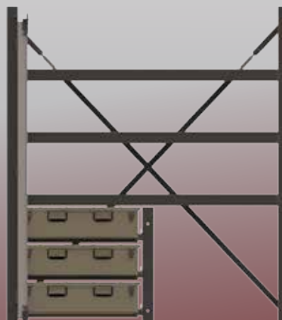
WORKBENCH AND SHELVES