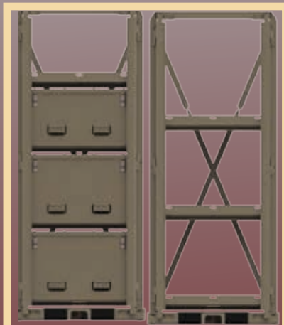
Storage for Large and Light Bulk Items