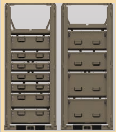
Storage for Small and Medium Items