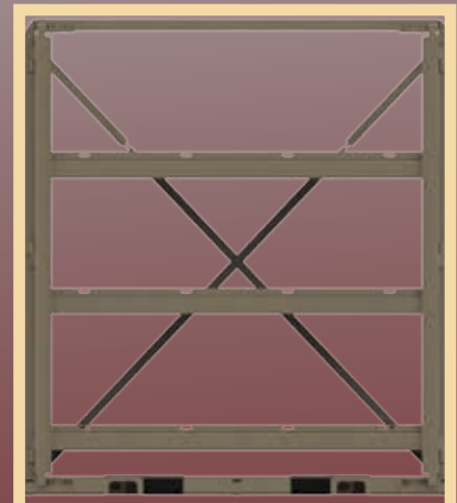
Storage for Large Bulk Items