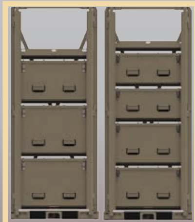
Storage for Large and Medium Items