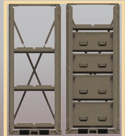
Storage for Light Bulk and Medium Items